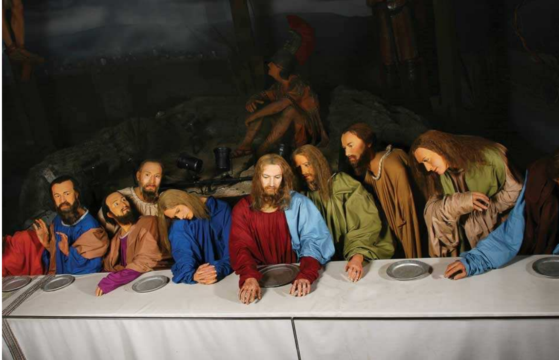
The Last Supper / 12 Apostles

CALABASAS, CA. - For the first time in its 44-year history, the world-famous Hollywood Wax Museum is offering hand-sculpted wax figures and original costumes for auction. Over 200 figures, including top stars, musicians, athletes, and historical individuals that have been seen by millions of visitors in Hollywood, CA and Branson, MO from the 1970s to present will be sold by Profiles in History, the world's leading Hollywood memorabilia dealer, on Friday, May 1, 2009. Worldwide bids can be placed either in person, via mail, phone, fax or live on the Internet at Profiles in History .