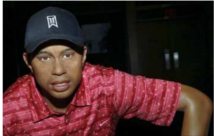
Better than being frozen in carbonite.

We badly misuse the word "unique" in the memorabilia business. We use a word that literally means one-of-a-kind and apply it liberally, when we really mean that an item is rare, hard to find or just plain quirky. Seldom is any collectible actually No. 1 of 1.